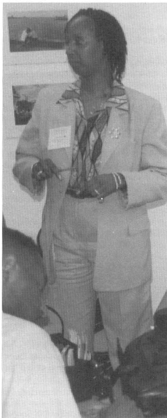
Topical Lunch Groups

One person in the group said that a "primary person does not mean an exclusive person. In actuality you were not handing the kid off to the art instructor... You were using your role as a primary person to help that young person make other positive relationships." The new relationship formed can often be even more beneficial to the development of that young person. A holistic approach identifies and